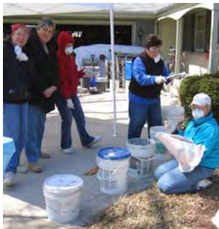
Participants glazing their bisque-ware.