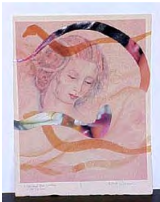
Leda , 2000 monoprint, watercolor pencil, collage 11"x8.5" (based on da Vinci's Leda ) by the instructor