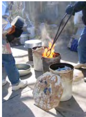
From kiln to garbage can!